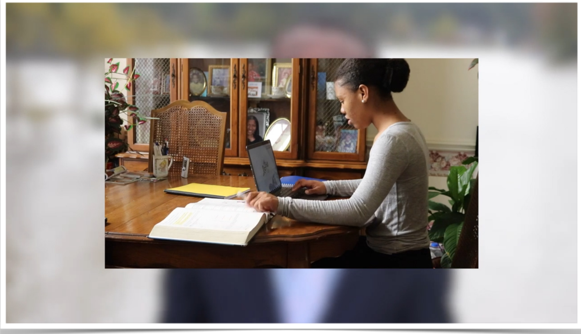
bb t Social Worker

"You have to have a certain free and reduced lunch percentage to qualify for your school."