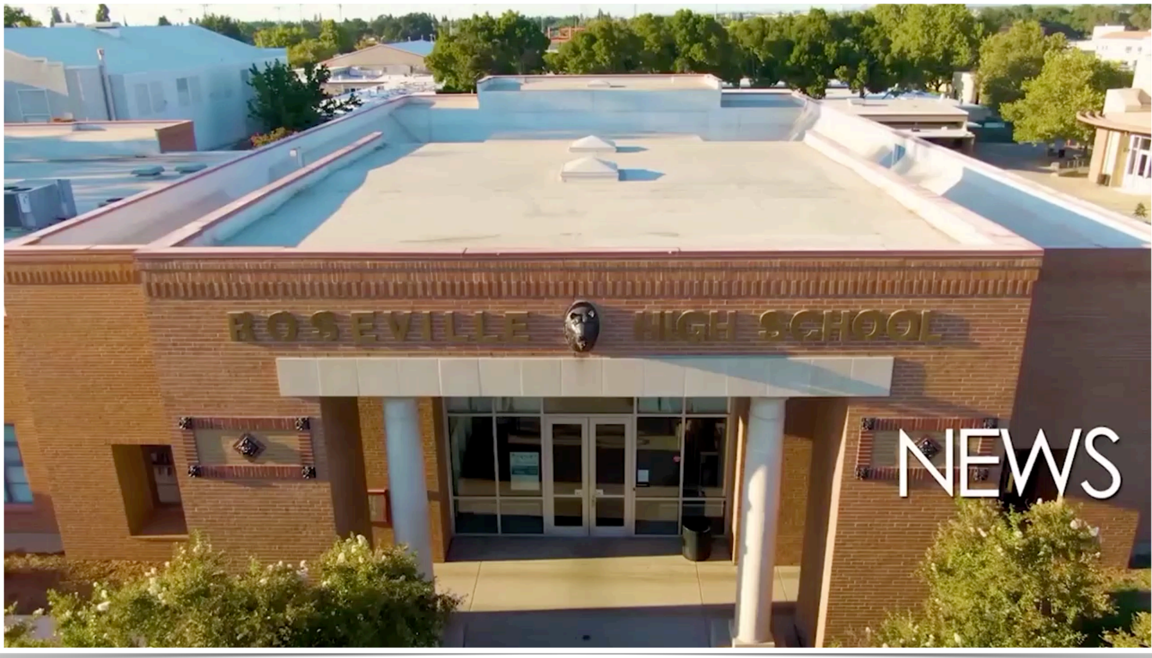
Eye of the Tiger News Roseville High School — Roseville, California