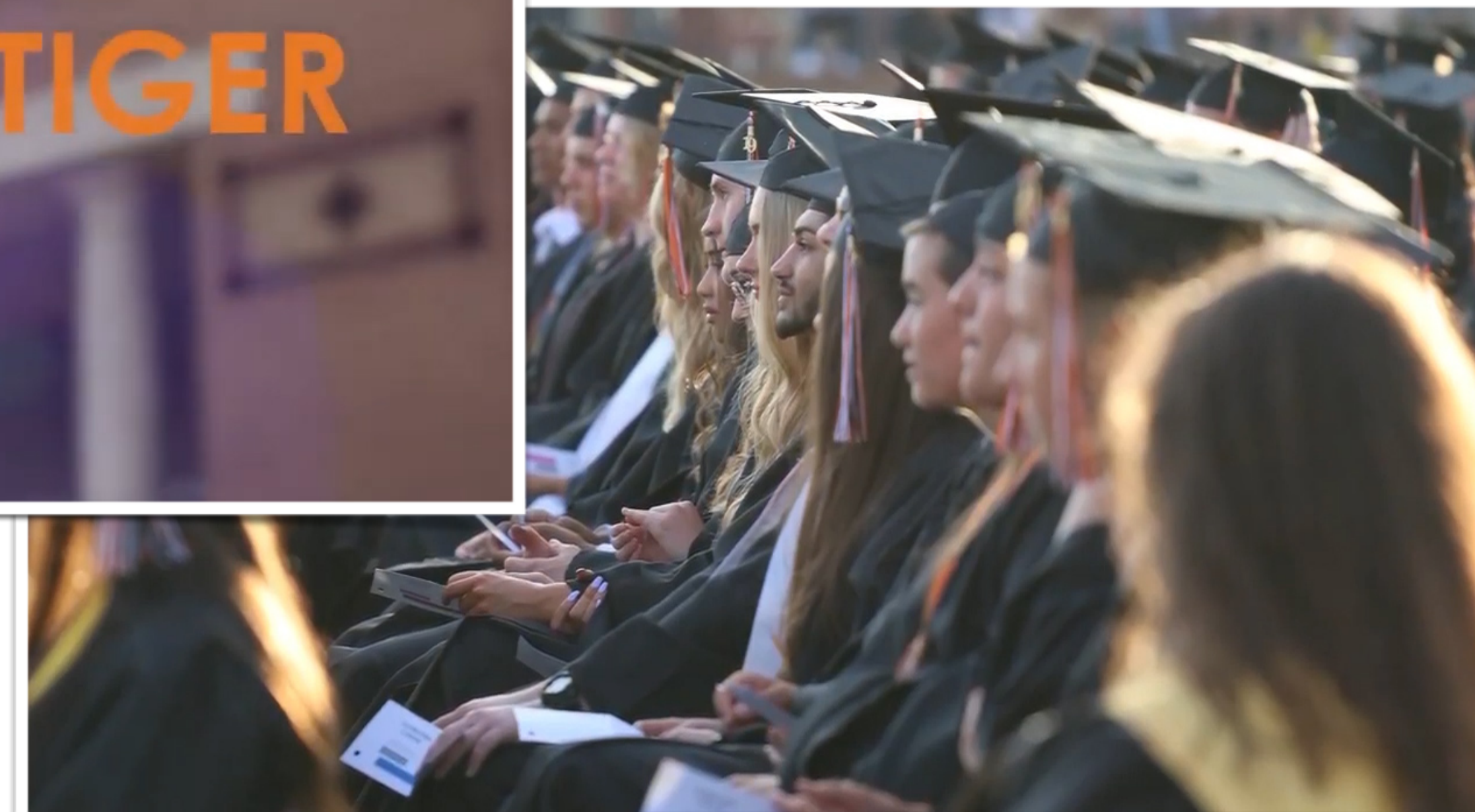
Eye of the Tiger News Roseville High School — Roseville, California